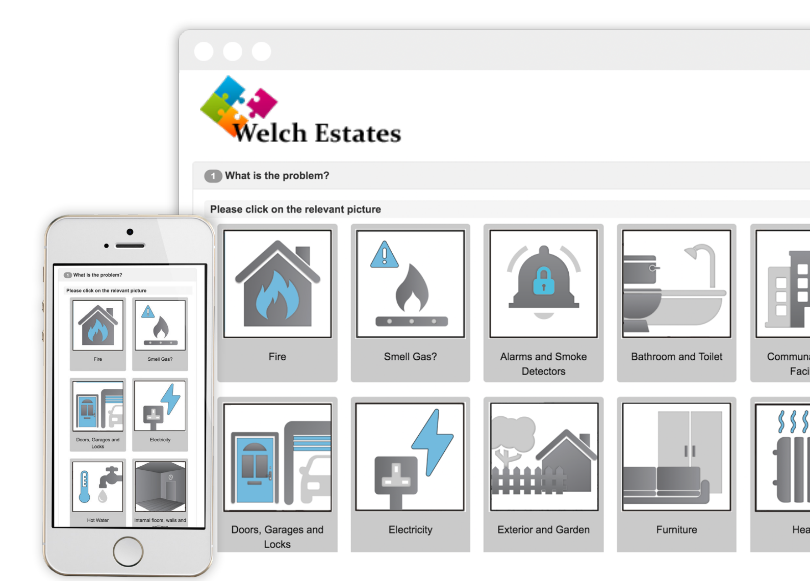
In-built advice for emergencies makes sure your tenant knows how to protect your property if the worst happens